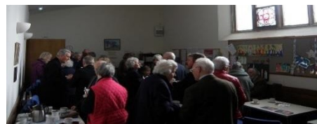
Flavour of our Church life